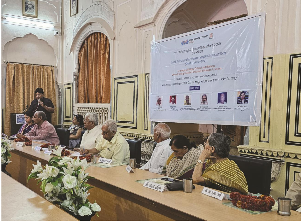
Dignitaries on the dias